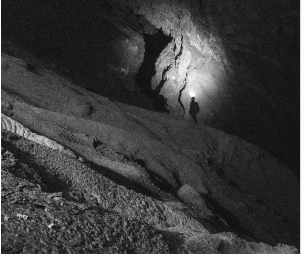
Figure 4. Part of the c.50 m long dune in the main Sand Dune Chamber.

where the stream following the wall quickly led to a sump. En route there are various unclimbed roof voids and the slight draught remains a constant feature throughout the cave, suggestive of continuing passage.