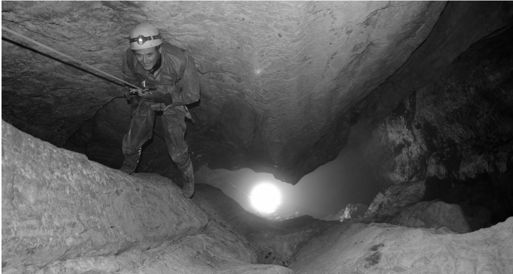
Figure 1. Pištet 4 Entrance pitch.