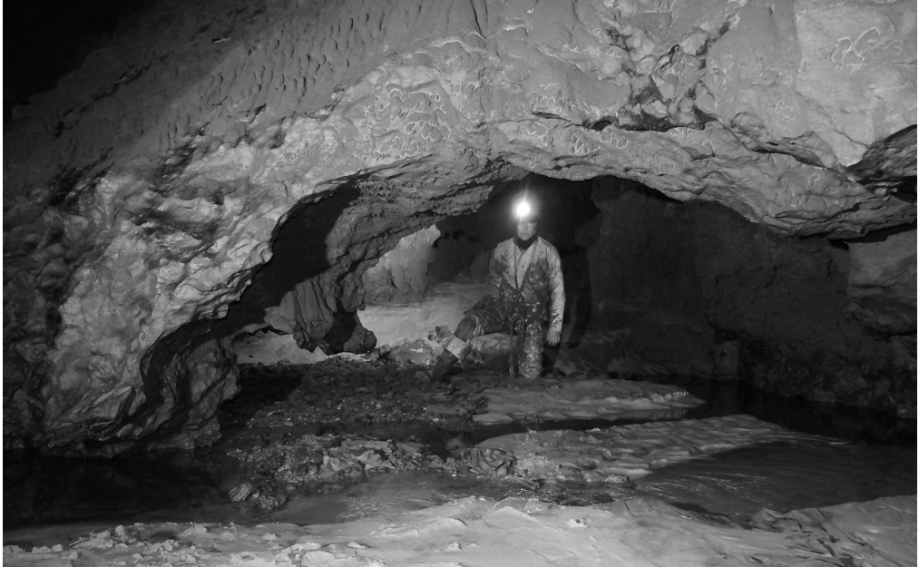
Figure 5. Side stream passage off the main Sand Dune Chamber.

pronged approach for a future expedition should include diving the sump and bolting the nearby avens, in search of bypasses and higher level continuations.