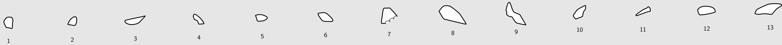
Cross-sections at the same scale as the plan and elevation.