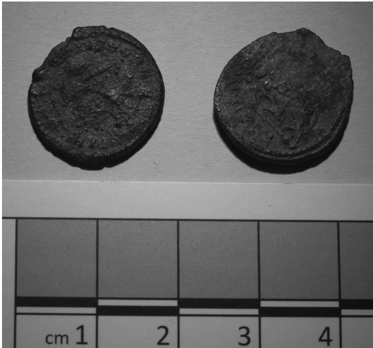
Figure 2. Two coins, first side view.

c.350-360 2) Possibly the same c. This implies that they are counterfeit fourth century coins copying a type of coinage introduced as part of the coinage reform of 348 AD by Constantius II and Constans. All these coins apparently bear the reverse legend FEL TEMP REPARATIO ('Restoration of Happy Times'). This has been colloquially translated as 'Happy days are here again!' (Smith, 2000).