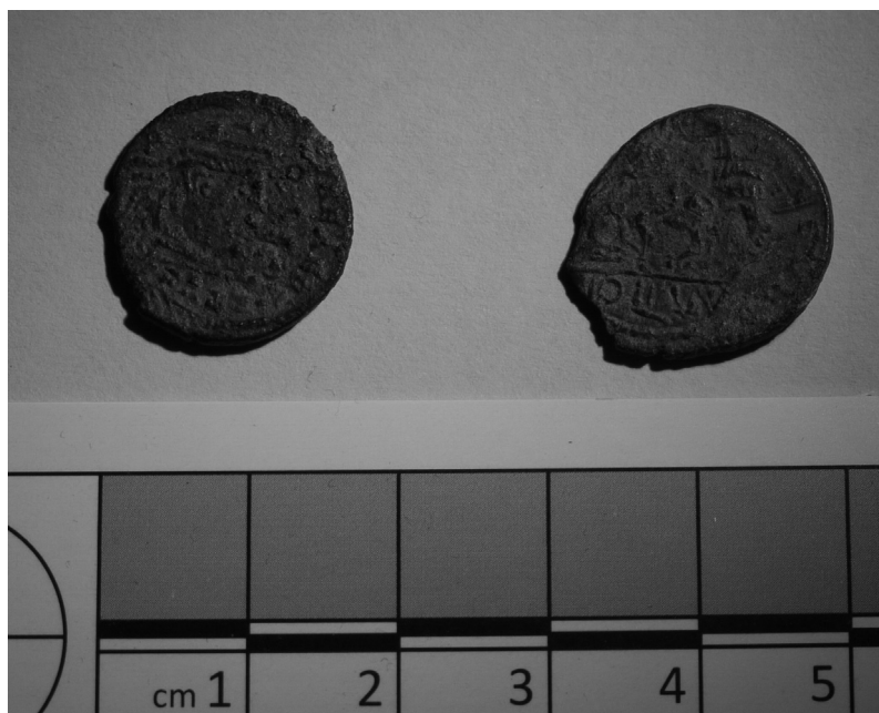
Figure 3. Two coins second side view.

Roman coins and, indeed, their makers' tools have also been found on Mendip (Barrett and Boon, 1972) so a find of two, possibly counterfeit, Roman coins in a Cheddar cave is neither surprising nor unusual.