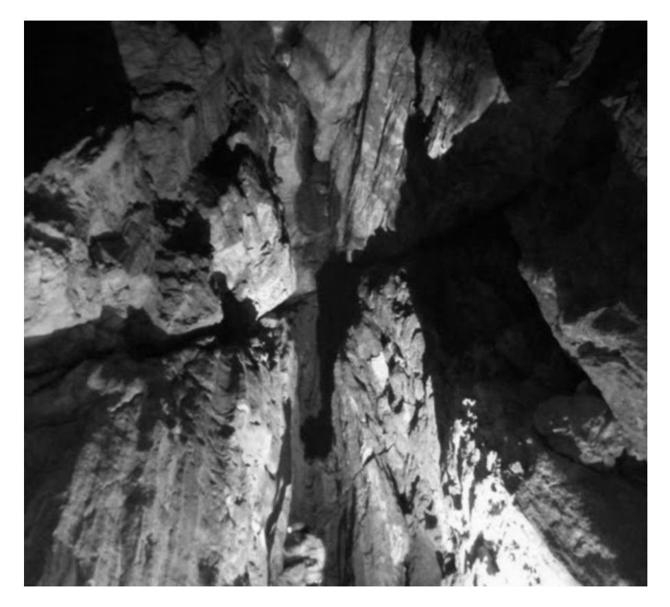
Figure 5. Pištet 4 Entrance pitch .

During the expedition PT4's entrance was observed to exhale air at an apparently nearconstant rate. Not once during the expedition did the breeze cease or change direction. The movement of air continued to be felt all the way down to the present limit of exploration. Mike "Fish" Jeanmaire ( pers. comm. August 2009) explained that caves of fixed volume have a temperature 'switch point', usually at a similar time of year whereupon the direction of the breeze alters from inhalation to exhalation, to reflect the seasonally changing surface temperature. It would therefore be interesting to note the wind direction at PT4 during the Winter and Summer months to find out whether it alters. At the aperture above pitch two where the air current is very strong, it would also be easy to get a good wind speed reading and area cross-section and determine the flow, allowing calculations to be made which might help deduce the volume of lower parts of the cave.