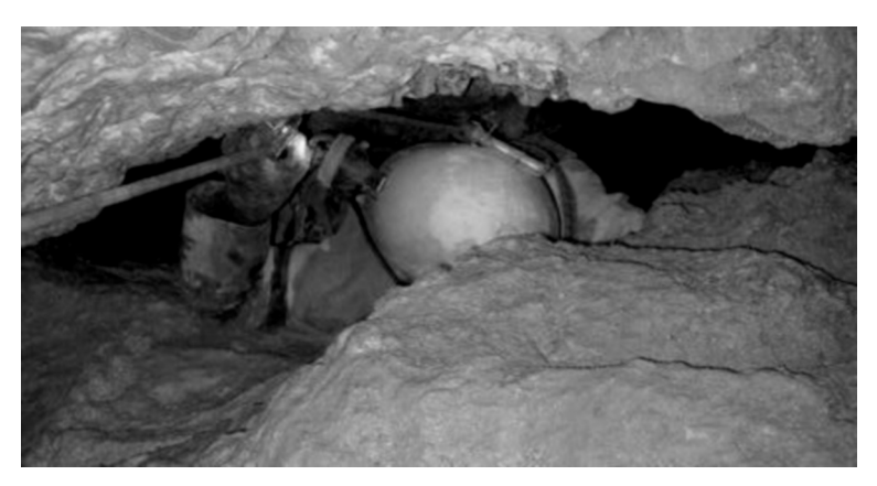
Figure 6. Pištet 4, 3rd pitch .

There are two impressive inlet avens, neither of which were seen to be active despite heavy weather. These presumably lead to surface depressions. The top of the avens appear to be in the region of 25 m high.