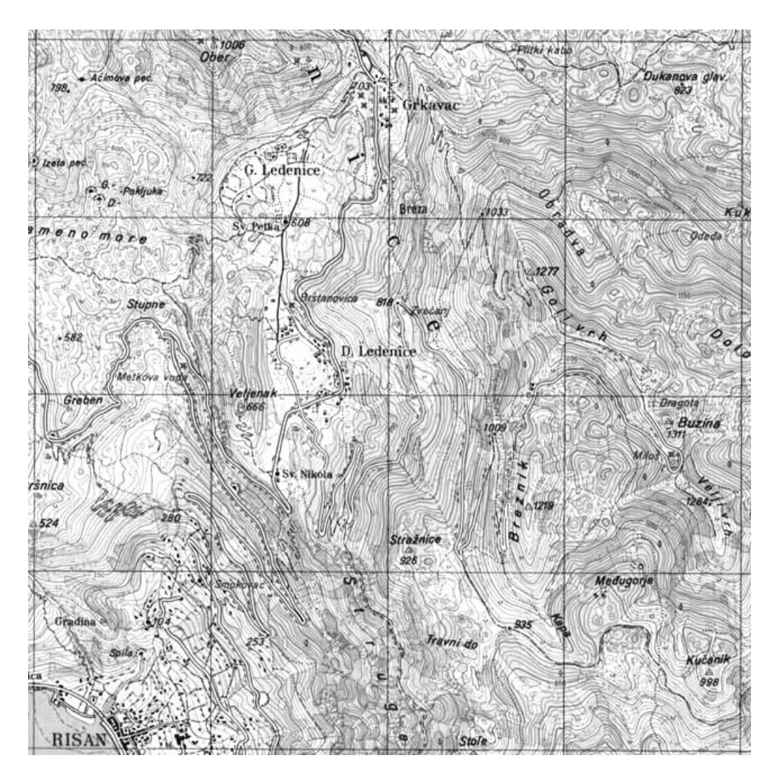
Figure 2. Map of Kameno-More region.

Further streamway, waterfalls and cascades Boulder choke causing (presumed) ancient and massive sediment banks Undescended mud trench/pitch and Huge chamber visible beyond large mud banks