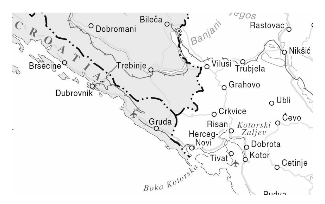
Figure 1. Map of Southern Montenegro.

The average annual precipitation for the period 1931-1960 was 4927 mm/m<sup>2</sup> and for 1961-1990 was 4631 mm/m<sup>2</sup>. The highest amounts per year surpass 7000 mm/m<sup>2</sup> with an all time historic high of 8036 mm/m<sup>2</sup> in 1937 (http://en.wikipedia.org/wiki/Crkvice). There appears to be great scope for many further speleological discoveries.